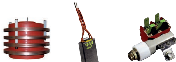
Slip ring assemblies